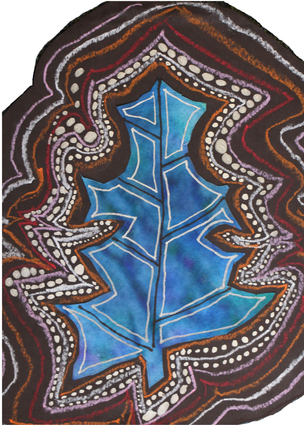
Armaan Alam, Grade 1 Harbor Hill