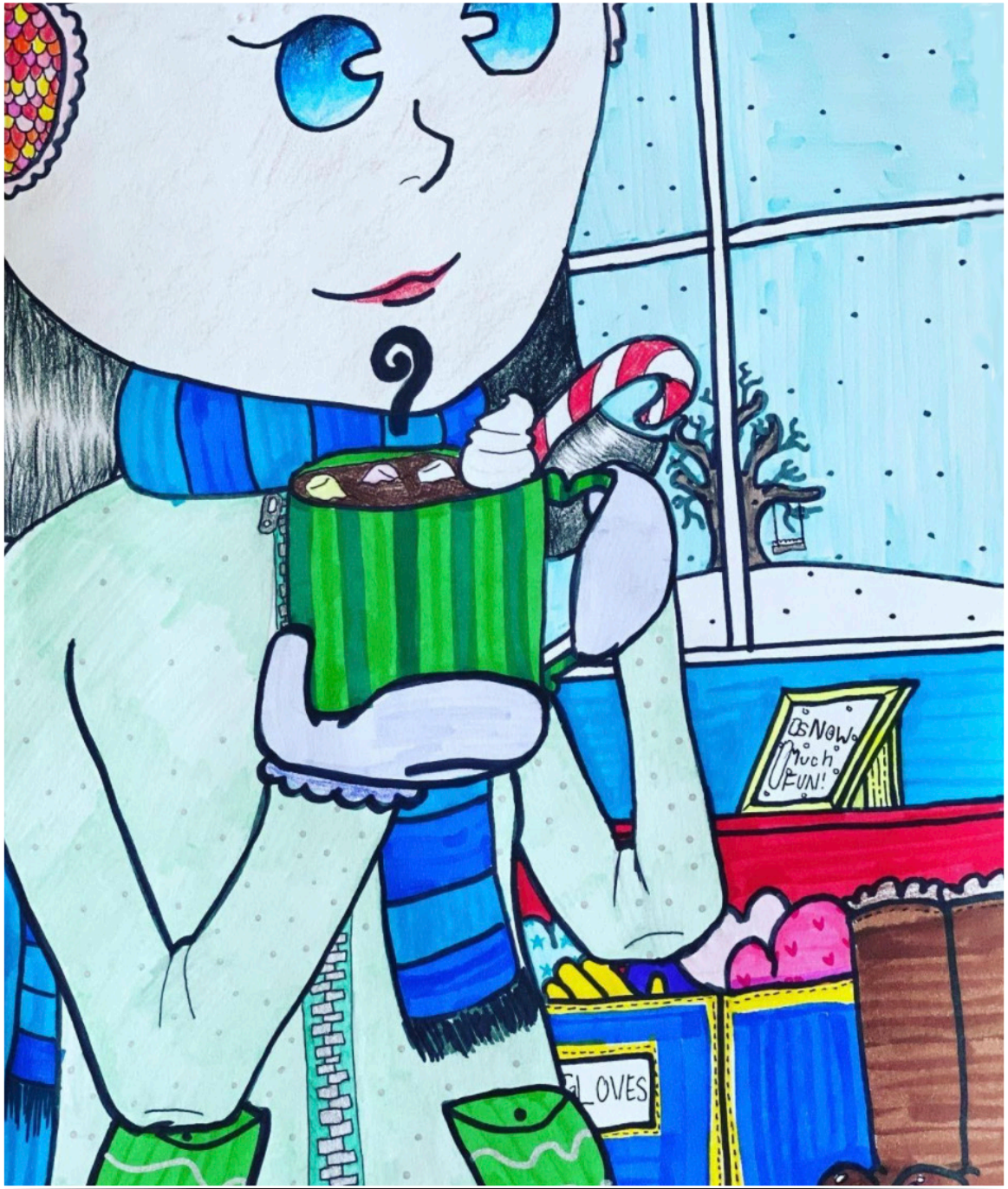
Charlene Lee, Grade 5 East Hills