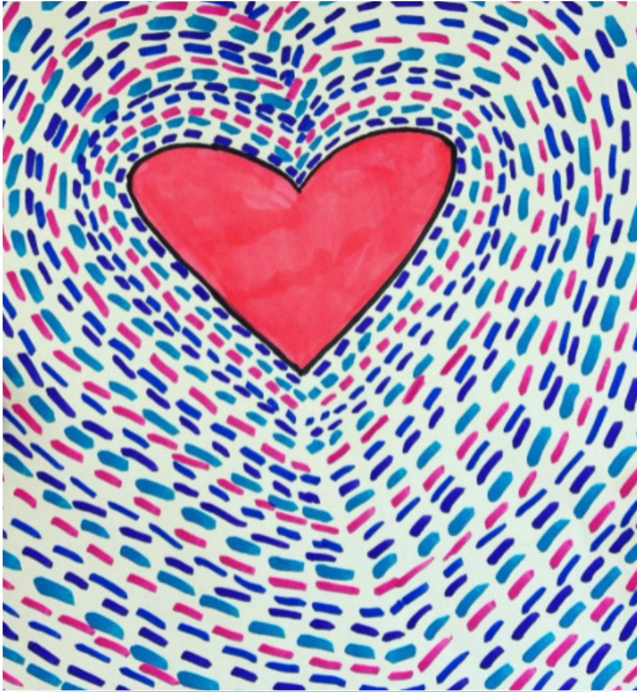
Reese Koppersmith, Grade 5 East Hills