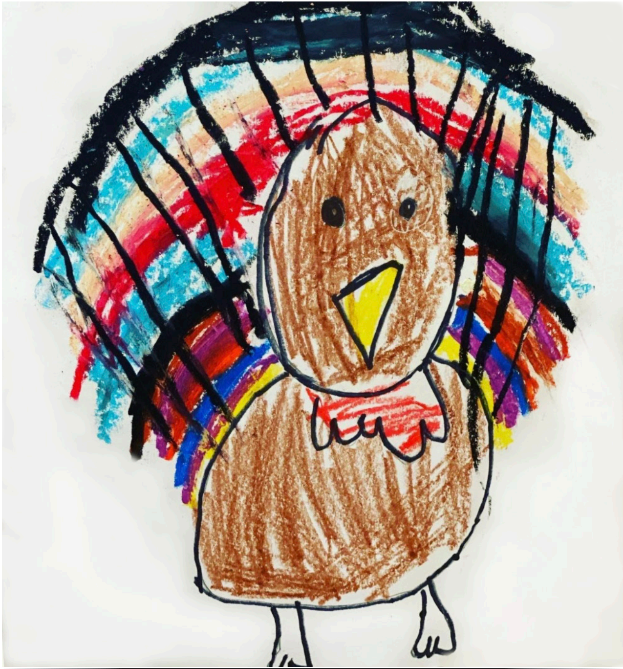
Sherwin Ye, Grade 2 East Hills