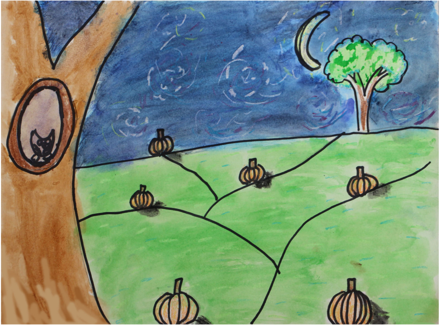
Zoey Kornblau, Grade 3 Harbor Hill