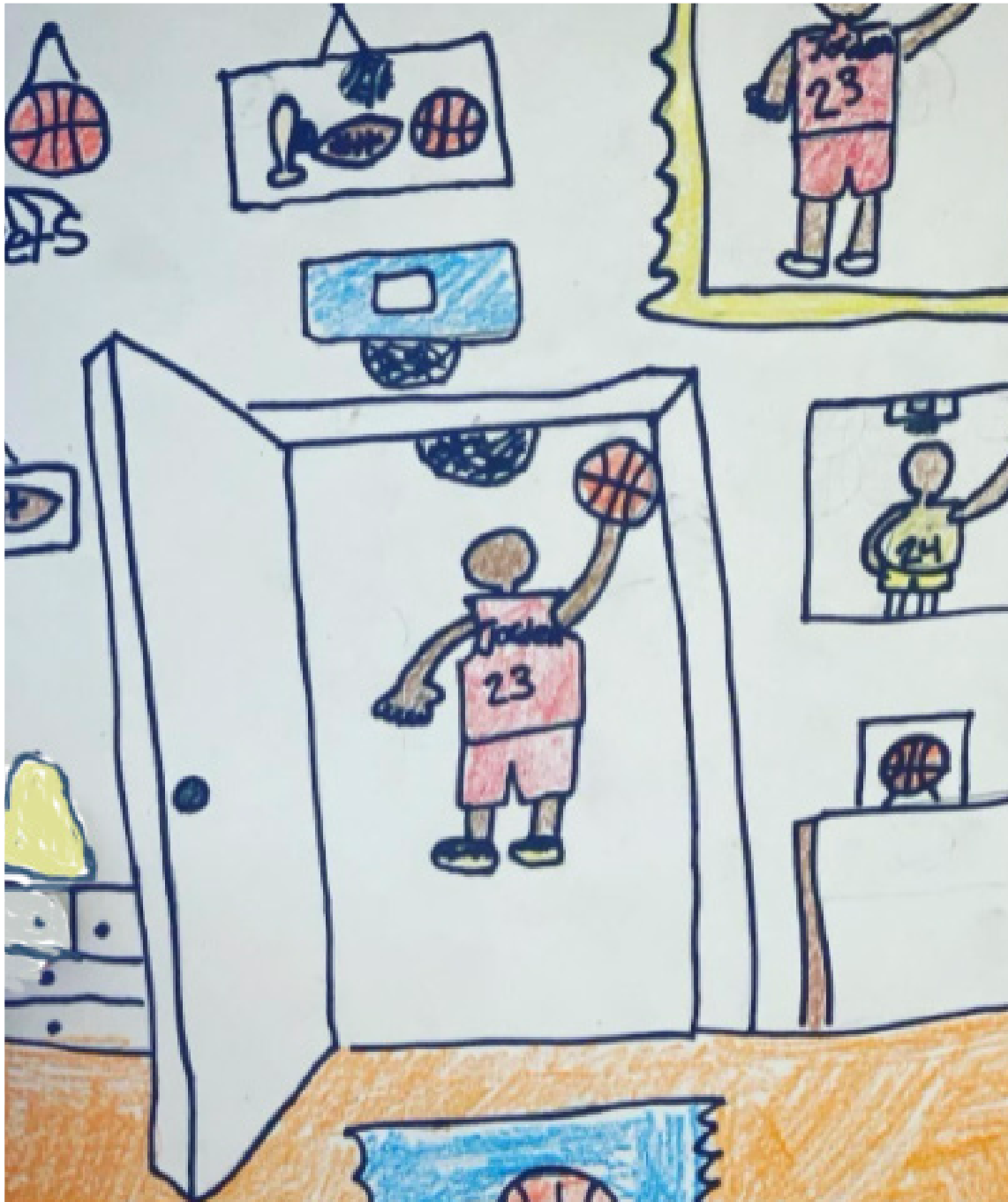
Ethan Weiss, Grade 4 East Hills